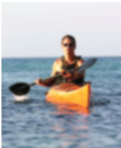
Vision with cataracts